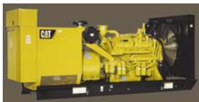
Dual Diesel Generators Provide Secondary Power Backup

VMT's data center facility provides redundancy through its dual PDU power systems on the floor. The hi-reli dual feed electrical service feeding the building is encased in concrete from the Georgia Power Substation Bank D. The 25 kV primary service electrical feed from the street to the building is also encased in concrete. In the event of primary service circuit failure, the dual feed feature is activated to provide continued electrical service for the building by automatically switching from the preferred circuit to an alternate circuit via a circuit switching module located at the Substation. There are three power company transformers providing 480/277 Volt, 3 Phase, 4 Wire services to three main switchboards (two 3,000 Amp main fusible switches and one 4,000 Amp main fusible switch).