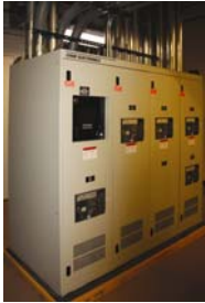
UPS system provides immediate failover in case of power interruption

A 400 Amps, 480 Volt, 3 Phase circuit is used to deliver Data Center power. The circuit is supported by a UPS and dual diesel generators. Additionally, the backup air conditioning system will be served from generator power.